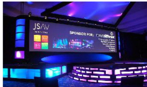
Images from MeetDifferent - Cancun 2010